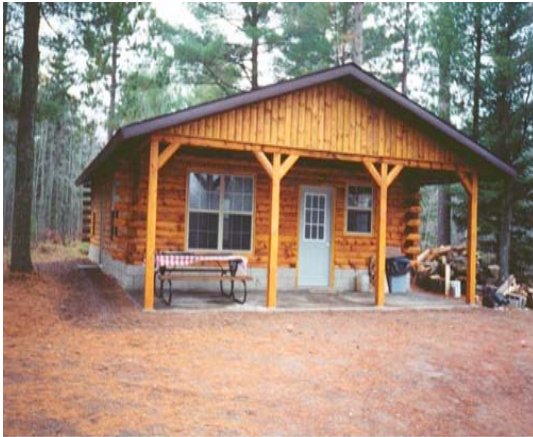
24 X 32 RANCH

Cedar River Log Homes P.O. Box 340 Powers, MI 49874 Phone: (906) 497-5365