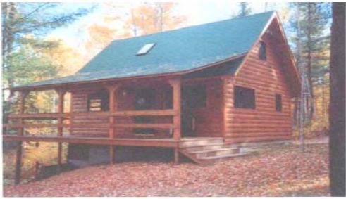
Country Cabin – 24 X 32

Cedar River Log Homes P.O. Box 340 Powers, MI 49874 Phone: (906) 497-5365