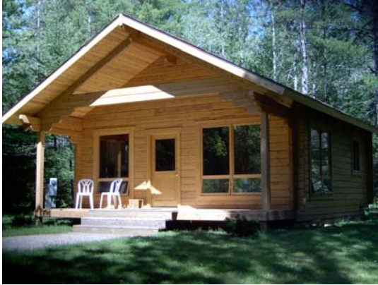
24 X 24 Cabin

Cedar River Log Homes P.O. Box 340 Powers, MI 49874 Phone: (906) 497-5365